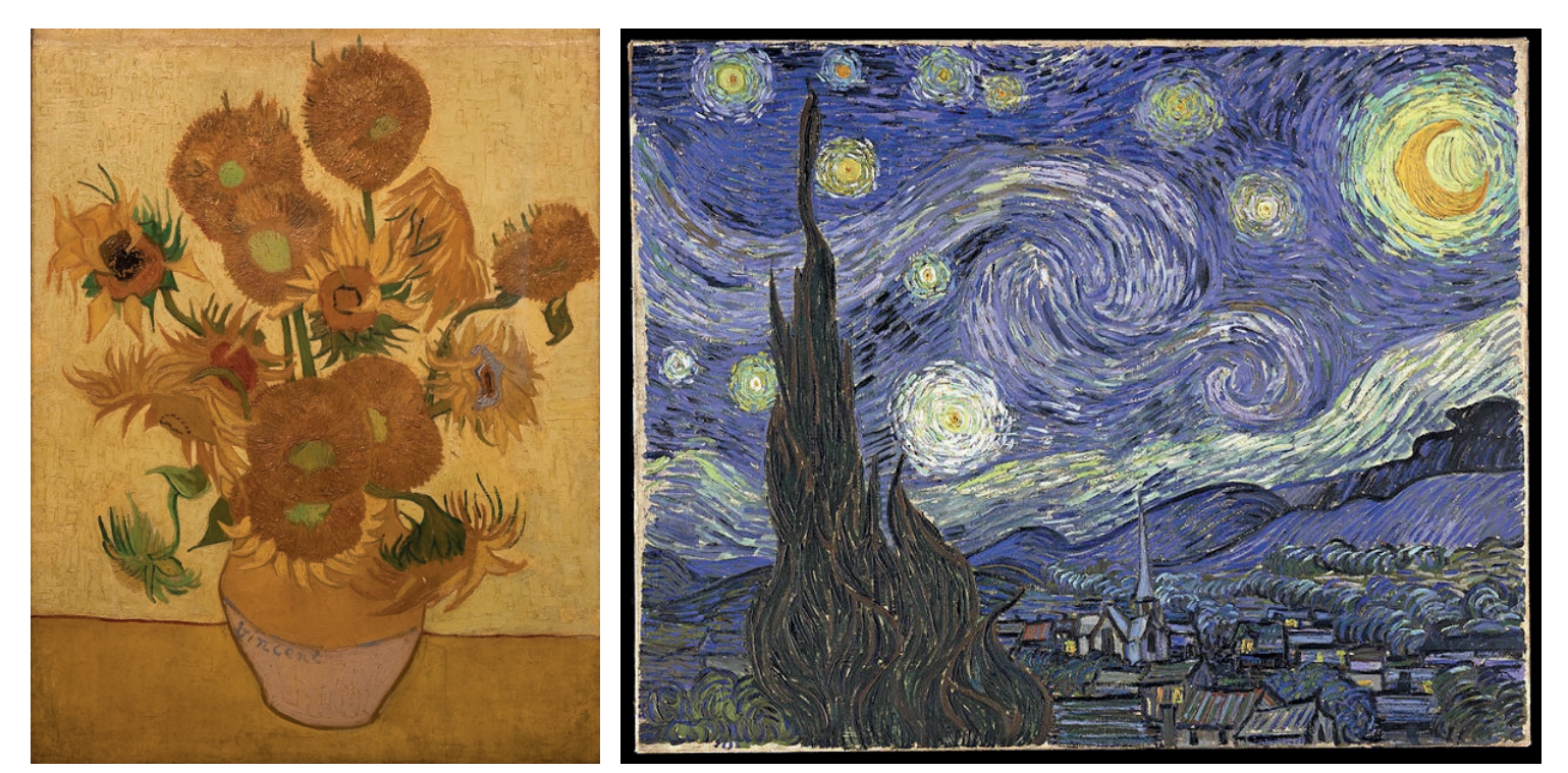
Work: Vase With Twelve Sunflowers & The Starry Night.