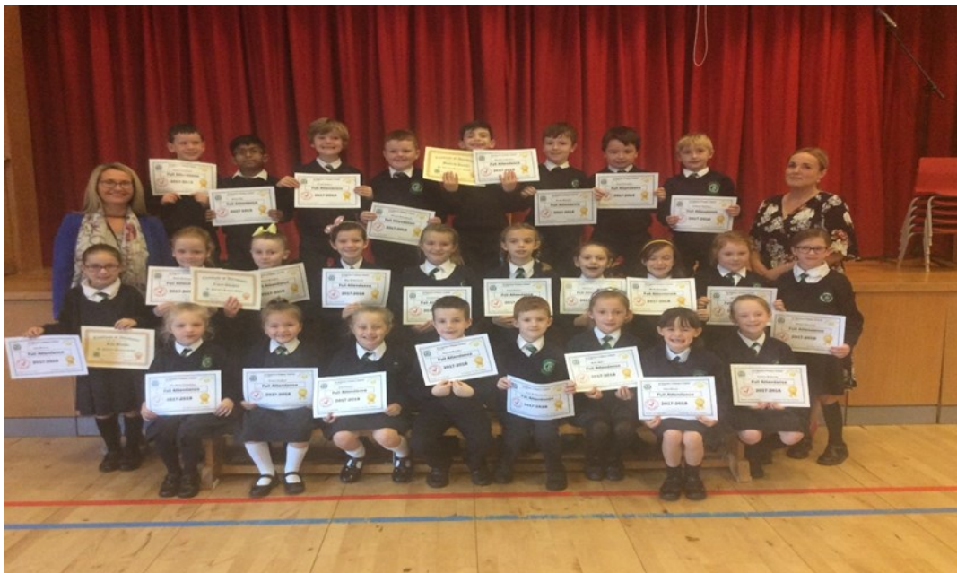
Children in the Foundation Stage who received Attendance Certificates for 2017-18.