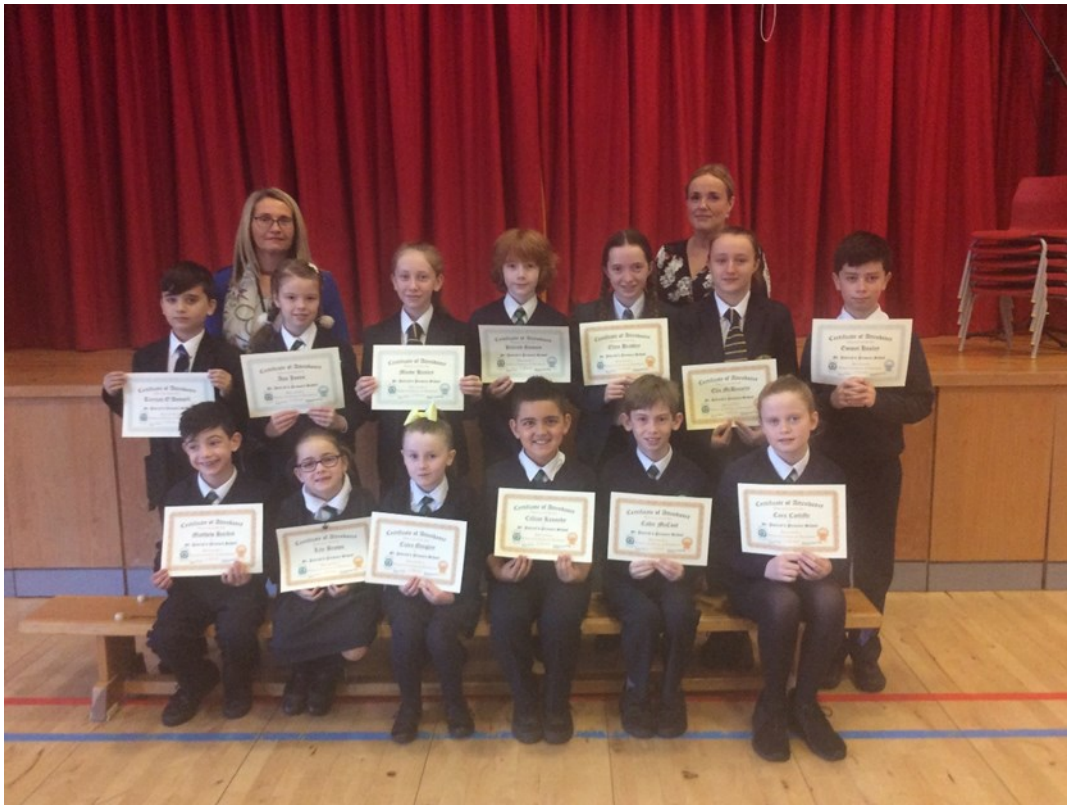
Children who received Silver and Bronze Certificates for Attendance in 2017 –2018.